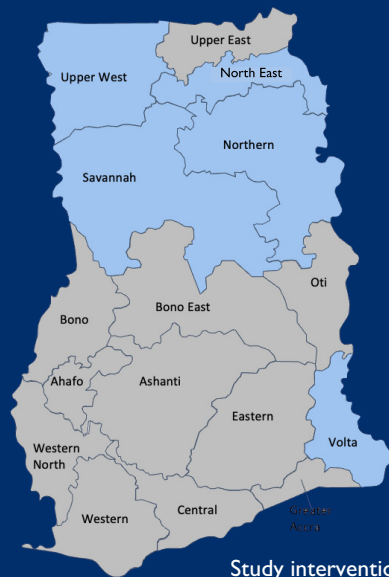
Study intervention areas.

The Enhancing WASH (EnWASH) program seeks to support consortium partners, and Ghana's WASH sector at large, to implement evidence-based activities that can extend the coverage of sustainable WASH services. One element of the EnWASH research agenda is to fill knowledge gaps related to the economics of rural water supply and the required investments to improve service delivery .